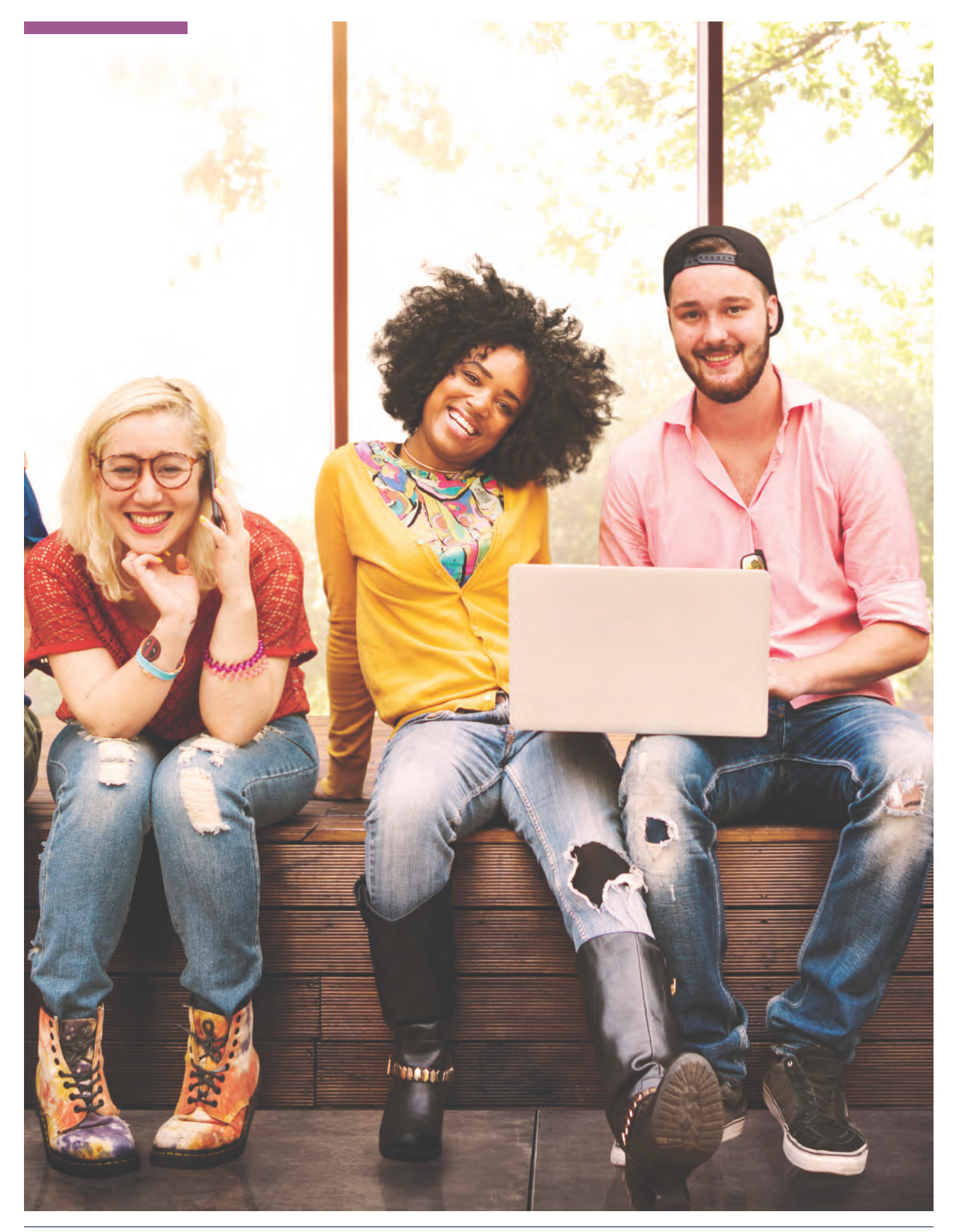
© National School Boards Association, 2016. All rights reserved.